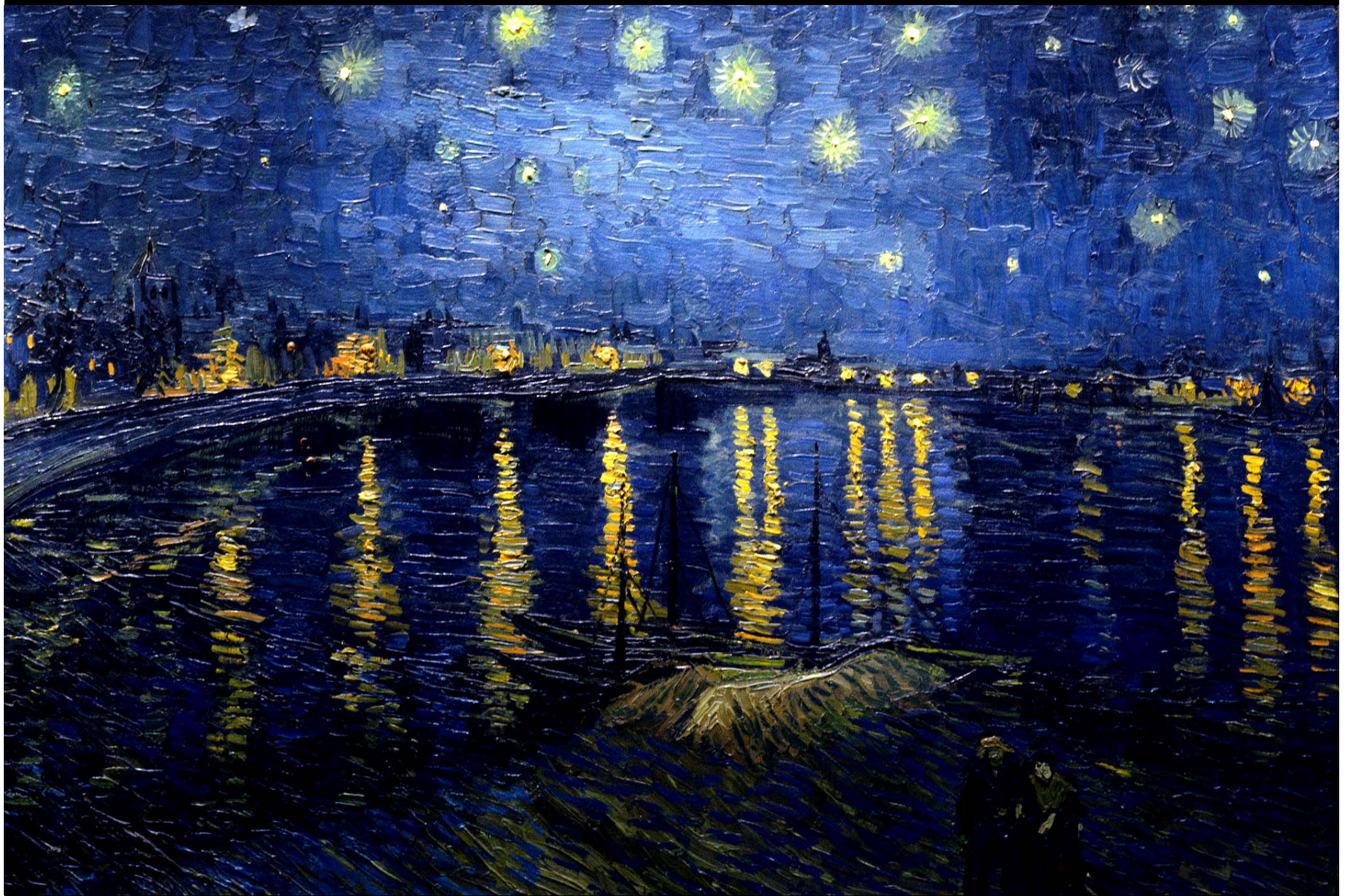
Starry Night Over the Rhone