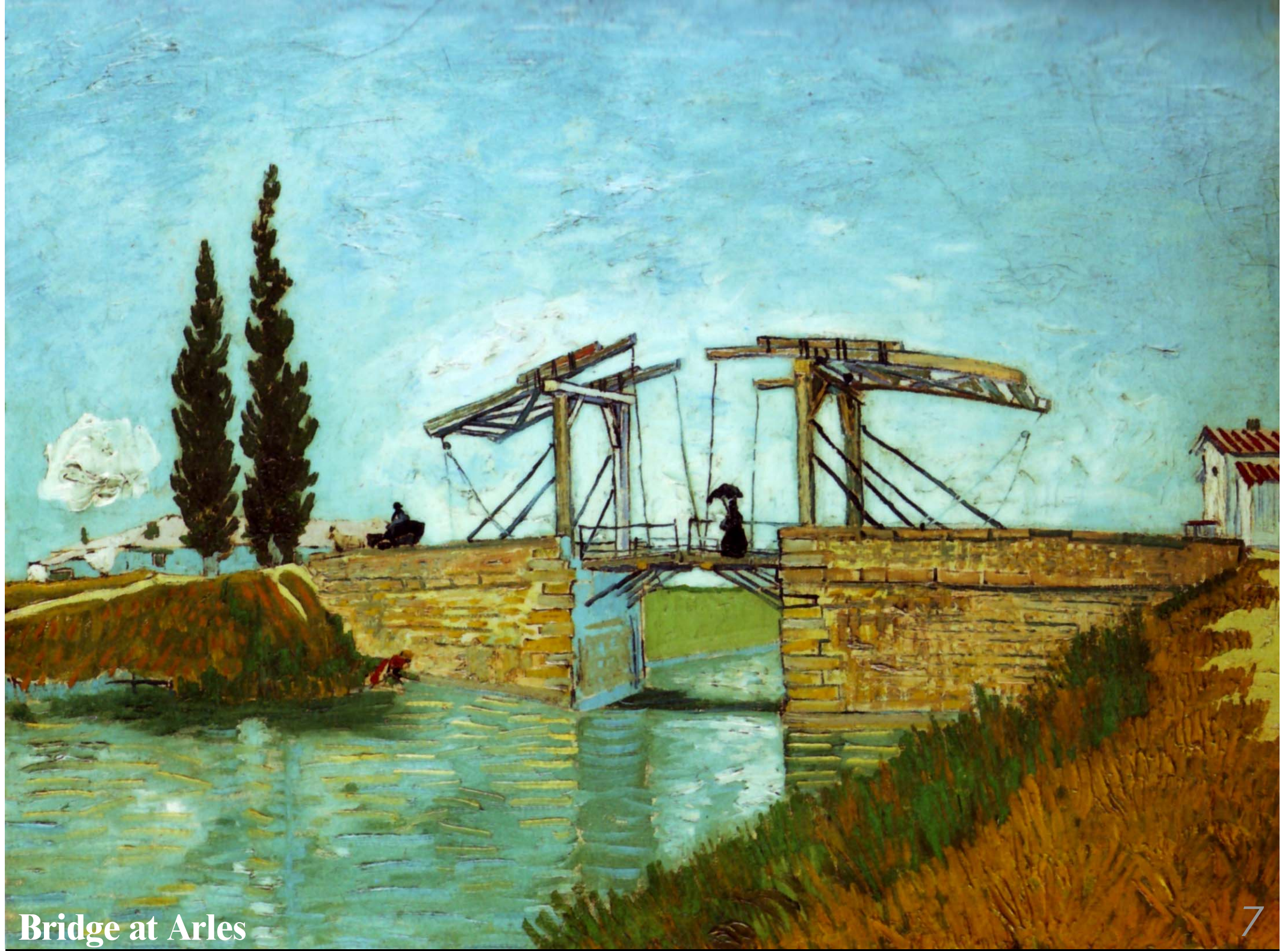
Bridge at Arles