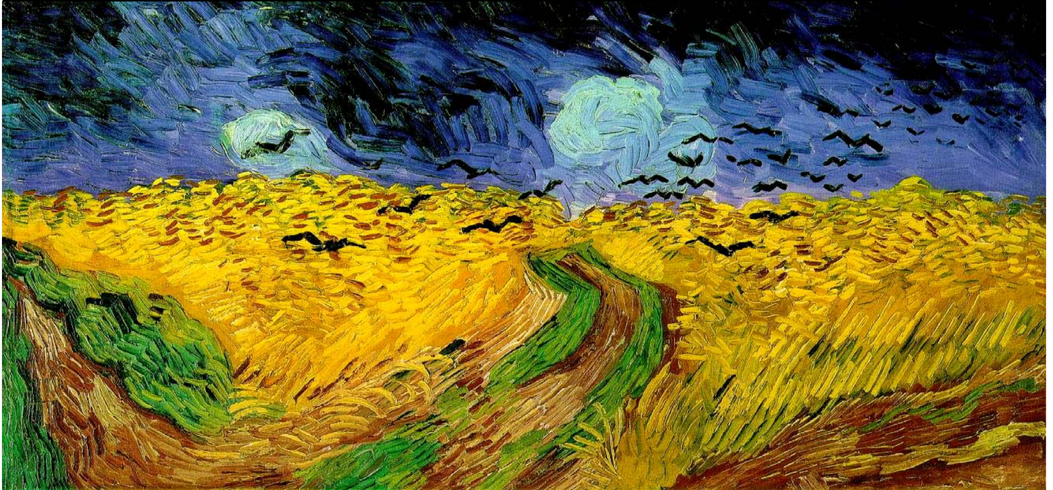
Wheat Field with Crows